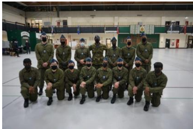
818 Sr Cadets after they completed their 6 week developmental Training Course.

However, we are all working to make the best out of what is at our disposal to give the cadets as many opportunities to develop skills, learn new things, understand the importance of serving and advance themselves and those who they aim to impact.