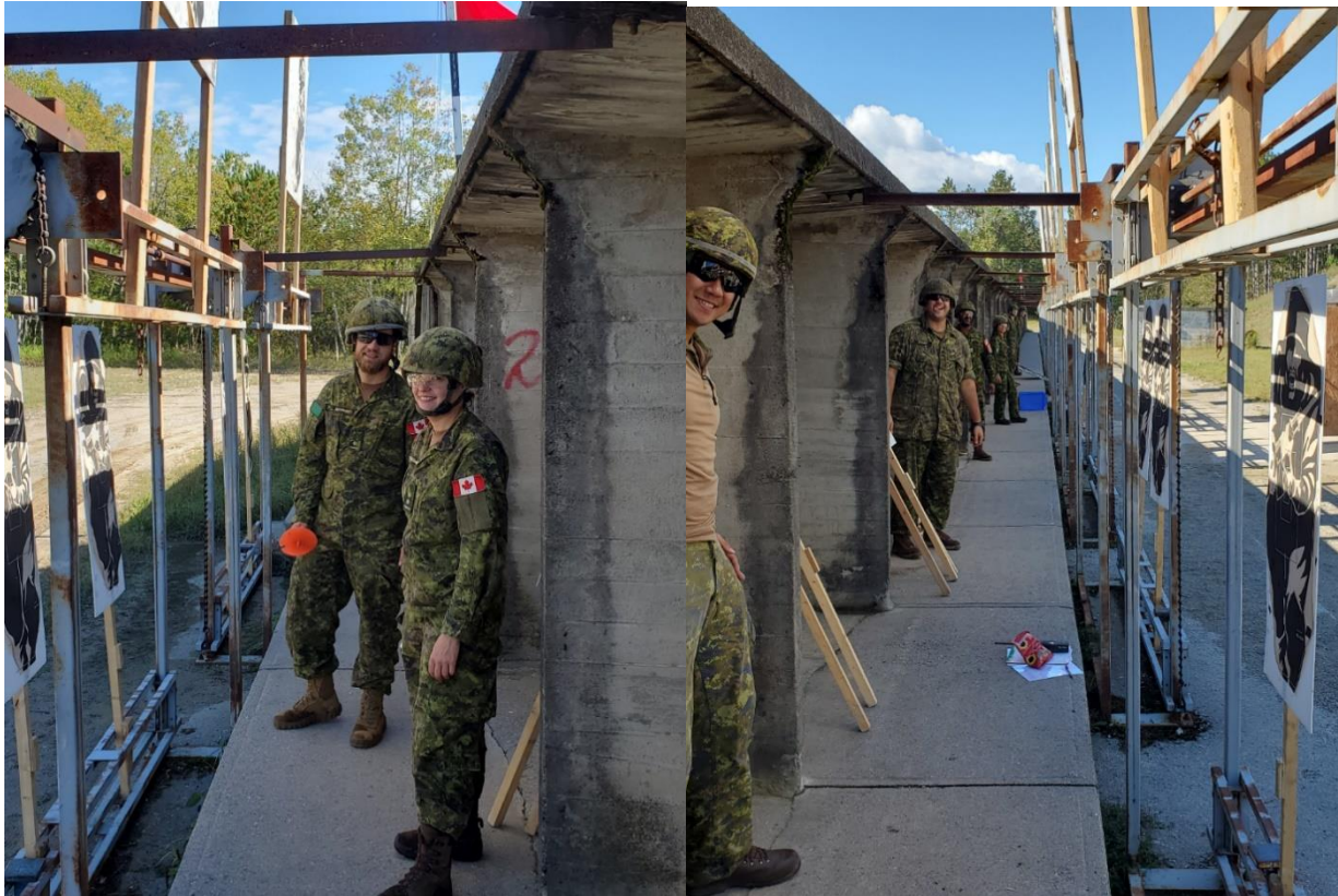
Butts Party - Ex Sharp Shooter 1, Borden ON

It is my hope that everyone and their families are able to continue working, or going to school during the pandemic. I look forward to being able to return to 100% parading in person at some point in the near future. Stay safe and healthy!