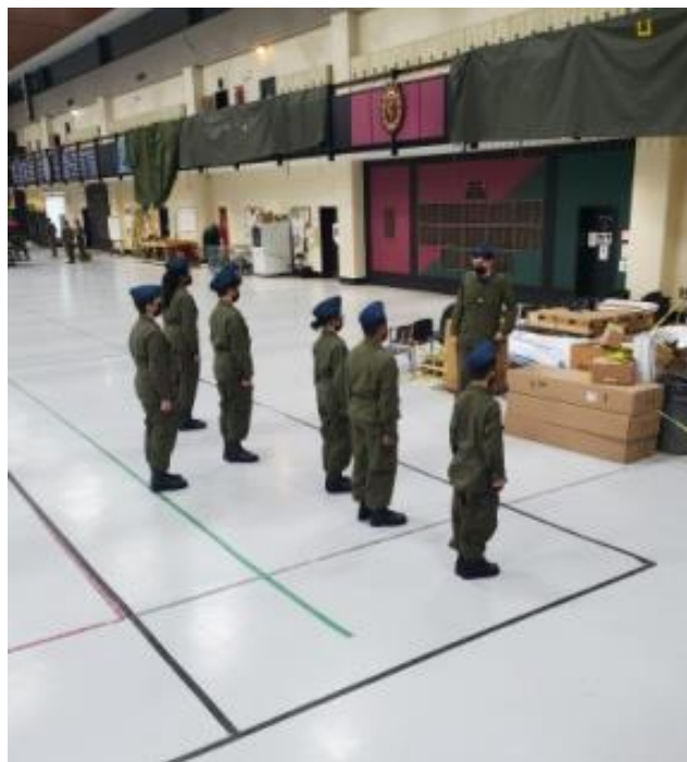
A newly promoted Flight Sergeant teaching a drill class to a group of new recruits.