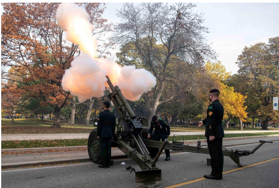
Sgt Potts – Gun # 2 Fires during Remembrance Day Salute.