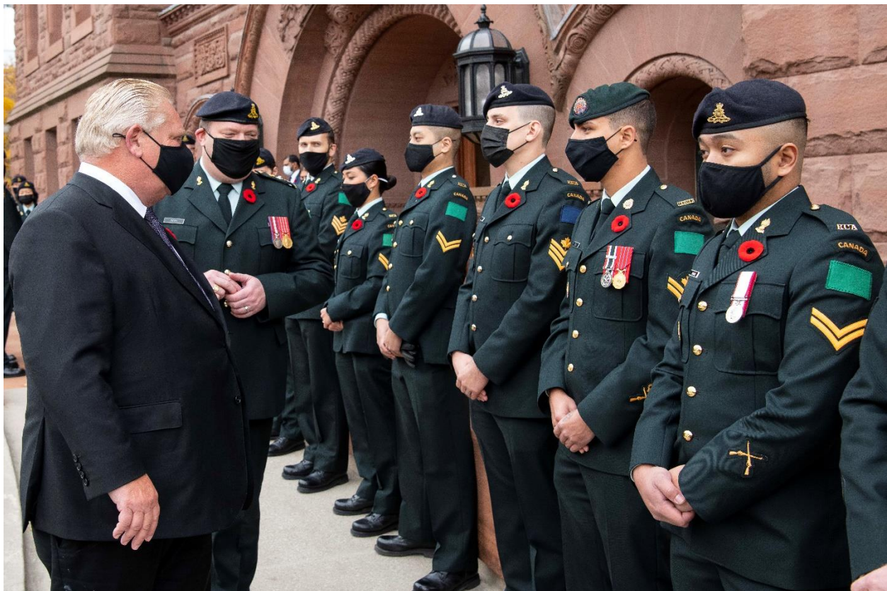
Premier Doug Ford inspects troops from 7 th Toronto Regiment during a Remembrance Day Salute 11 Nov 2021.

Those of you who were able to attend the Remembrance Day Gun Salute will recall that we were met by Premier Doug Ford who expressed his appreciation and support to all serving members in the CAF. It was certainly a busy Fall and was shaping up to be an equally busy winter.