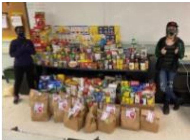
MWO Nayiga (left) and WO Newall (right) smile next to the food items collected for the donation challenge.