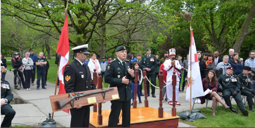
Enfield Short (Artillery) Rifle Manufactured in 1872 Saw Service with Halifax Garrison Artillery and “A” Battery, Kingston