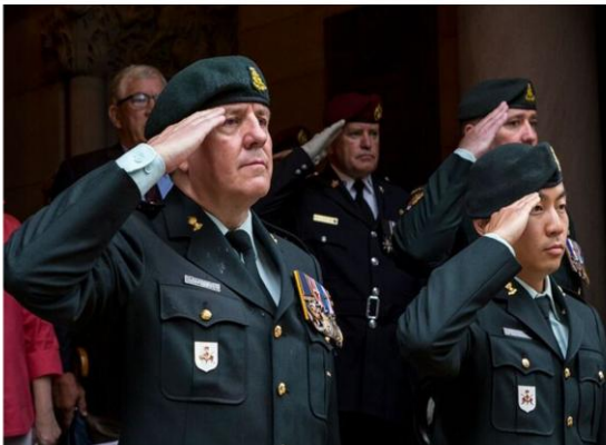
Colonel Commandant The Royal Regiment of Canadian Artillery Brigadier-General James Selbie, OMM, CD

An institution that throughout Canada's history has been an integral component of the defence and security of the nation and the well-being of its people.